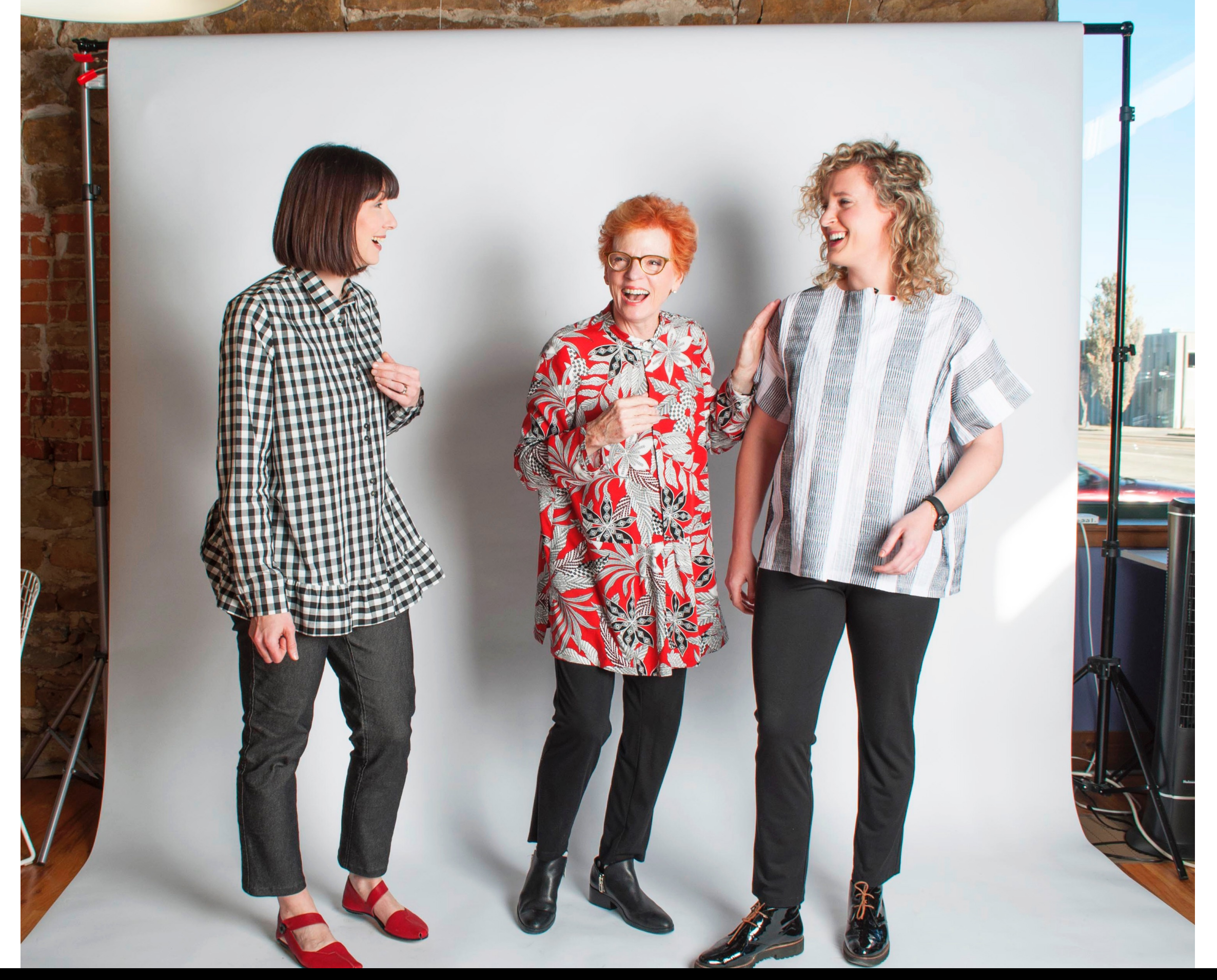
More fun to come on the Sew Confident! 2019 Wardrobe Tour